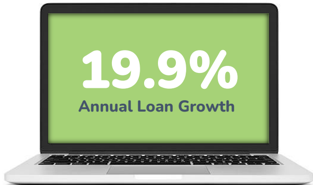
Innovation achieved 19.9% in annual loan growth in 2023.

By achieving national reach, Innovation was able to secure sixteen new strategic federal partnerships to help drive growth and financial stability.