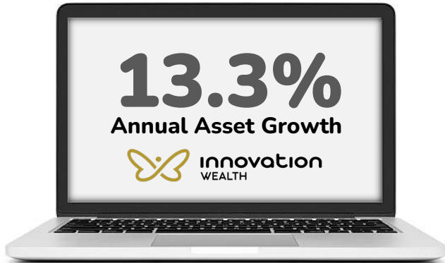
Total Innovation Wealth assets in 2023 grew by 13.3%.